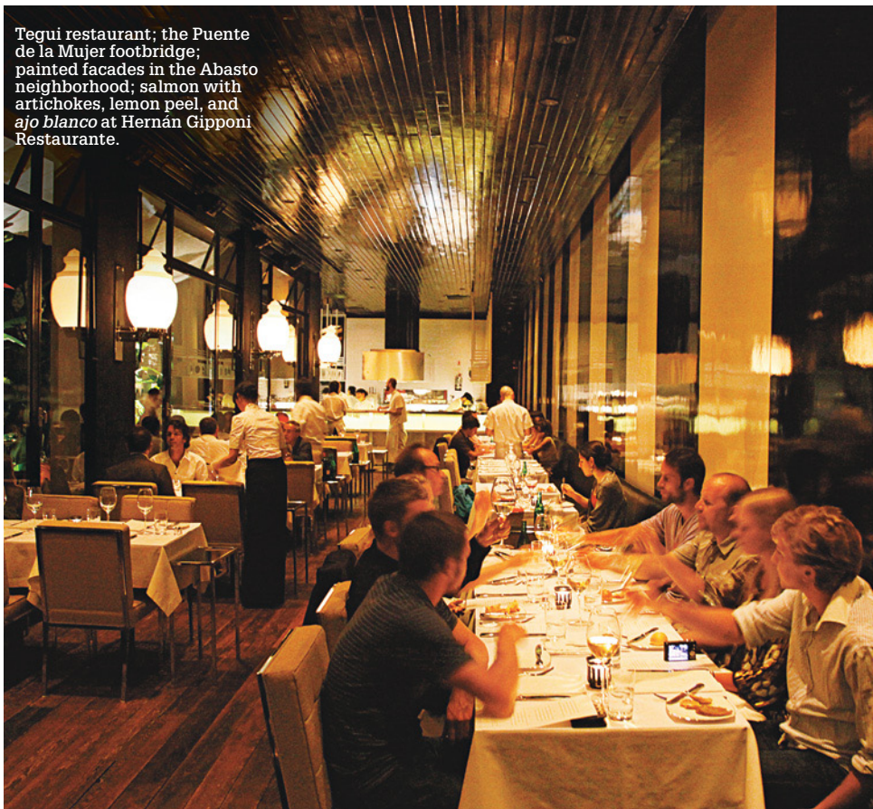
Tegui restaurant; the Puente de la Mujer footbridge; painted facades in the Abasto neighborhood; salmon with artichokes, lemon peel, and ajo blanco at Hernán Gipponi Restaurante.