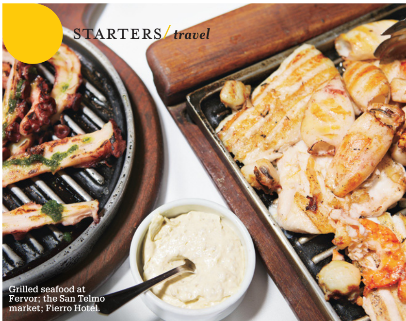
Grilled seafood at Fervor; the San Telmo market; Fierro Hotel.